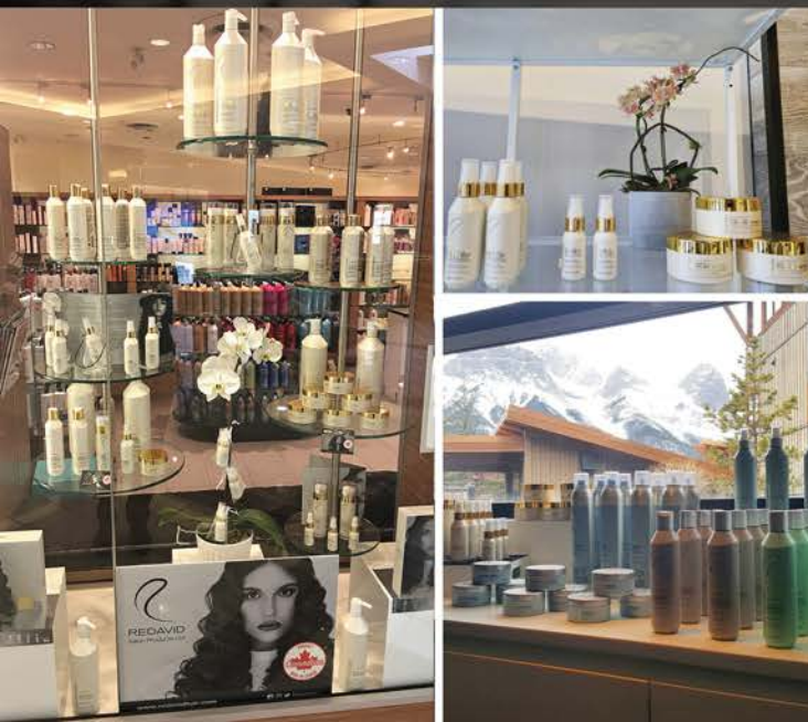
Photo: Revolutions Salon at Metrotown Center, Burnaby, B.C., Krave Hair Studio, New Westminister, B.C. & One Wellness & Spa, Canmore, AB.

Did you know that studies have shown that consumers are 65% less likely to purchase if retail shelves are cluttered or messy? To simplify, position REDAVID products with space in between and (if you have the space) at multiple levels. This gives you room for decor accessories to create interest. Many fellow salon owners decorate with an orchid or two, which also gives you an opportunity to tell the REDAVID story!